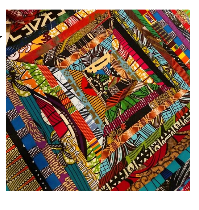
COLOR BLOCK BATIK HANDBAG