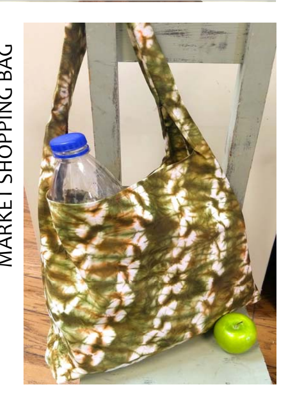
MARKET SHOPPING BAG